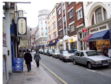
Nearby Greville Street