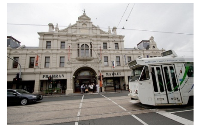
Prahran Market, Commercial Road